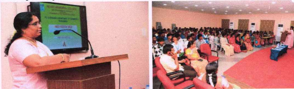
Fresher's Day Wishes by Head of the Department - Commerce

The Head of the Department of Commerce extended best wishes to the incoming students, encouraging them to embrace the opportunities and challenges of their new academic journey.